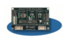
I2C/SPI Activity Board

Software and firmware upgrades are always freely available in www.totolphase.com