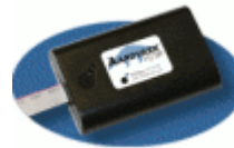
Aardvark I2C/SPI Host Adapter