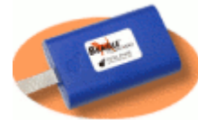
Beagle I2C/SPI Protocol Analyzer